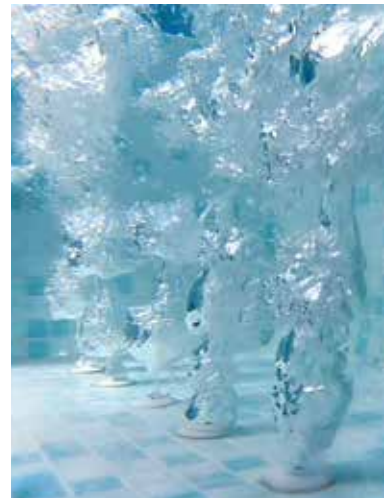
Closely spaced nozzles for an even spread of bubbles on water's surface

Closely spaced nozzles create a stunningly even spread of bubbles on the water's surface.