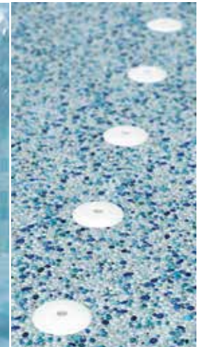
Neat and discreet finish in pool interior